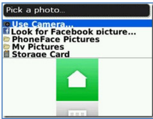
Picking a Photo in PhoneFace