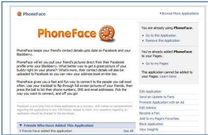
The Phoneface application as seen in Facebook

matches. Typing more letters refines the search.